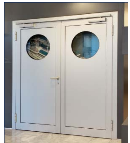
GEZE TS 5000 R-ISM

The door leaves in open position (due to E-ISM additionally: with engaged hold-open devices) when the door is going to be closed. The sequential closing function is provided by the moving leaf being held-open (it "waits") until the fixed leaf is closed.